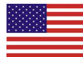
UNITED STATES OF AMERICA (WALMART ONLINE, CVS, AMAZON)

OUR PRODUCTS ARE PRESENT IN MARKETS SUCH AS: