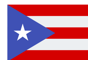
PUERTO RICO (WALMART STORES, ALWAYS 99)